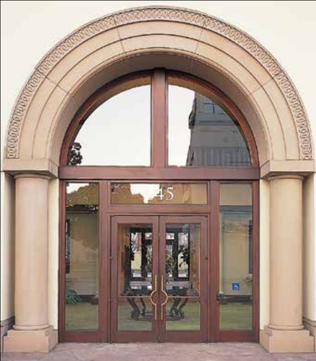
Archway supported by Custom Columns and Wainscoting in GFRC Sandstone.