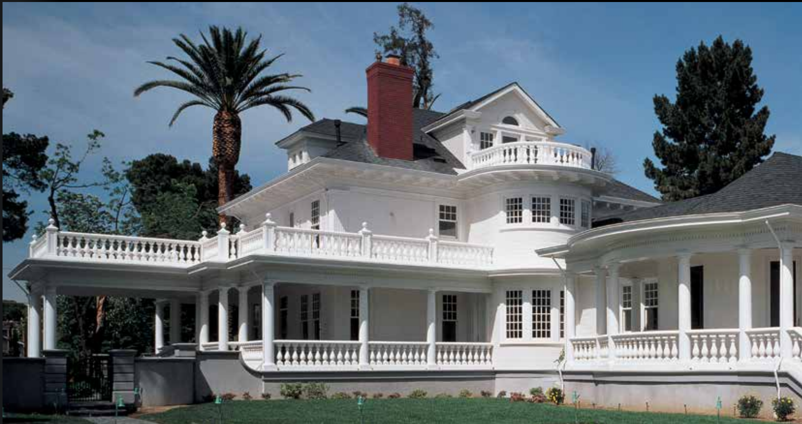
Historic Addition and Restoration Project. Style II Balustrade with Custom Georgian Columns, Wall Caps and Stackable Piers. in Paint Grade Finish.