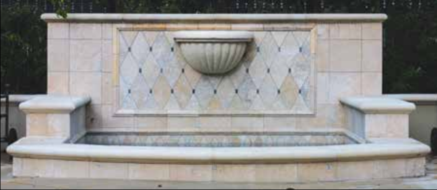
Wall Caps, Fountain Bowl and Pavers.