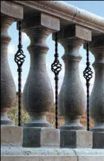
Balustrade System Style II in Travertine Finish with Alternating Wrought Iron Spindles.

Piers bring a distinct aesthetic element to the balustrade system while also providing structural strength and stability.