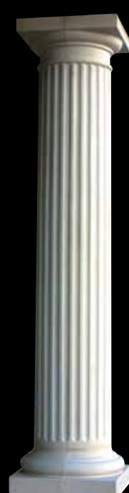
Tuscan Fluted Column