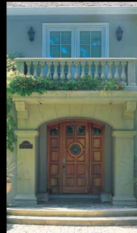
Archway, Pilaster, Stair Treads, Corbels, Lintel, Edge Coping, and Balustrade System Style II.