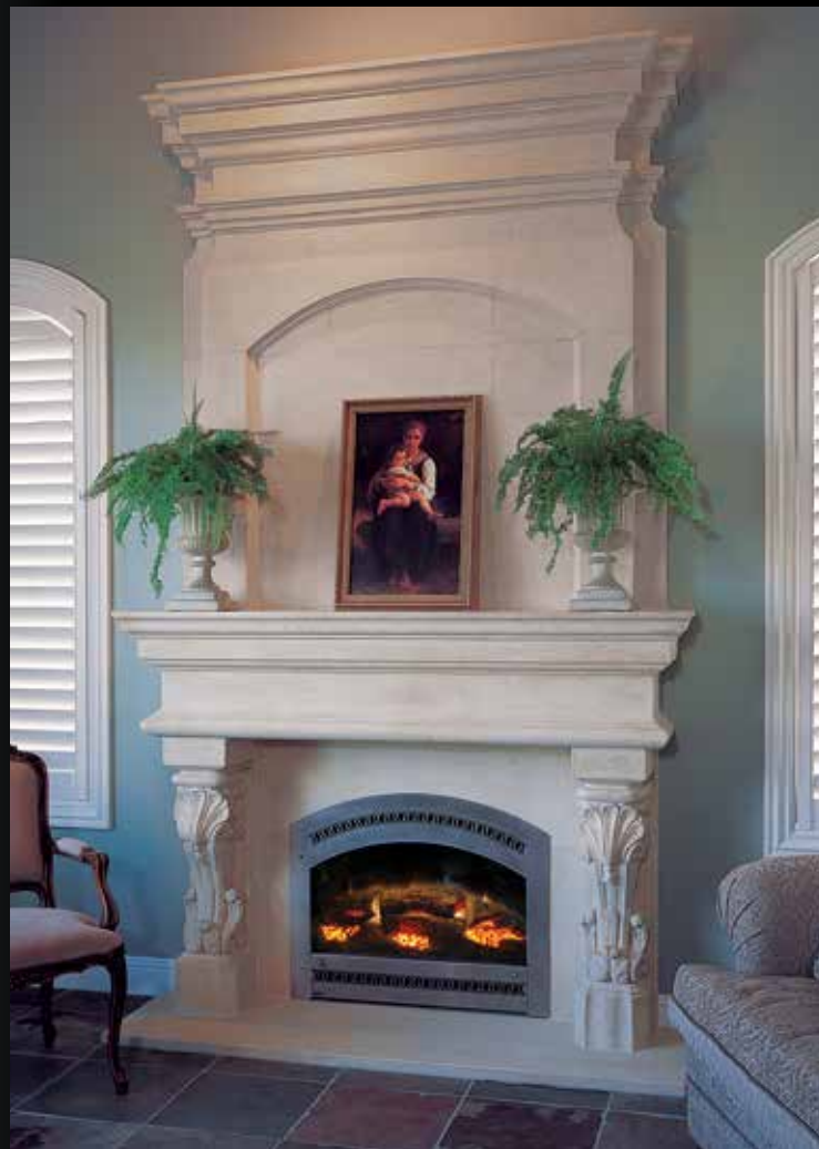
Botticelli from "The Euro-Mediterranean Collection", in our Sandstone Finish.