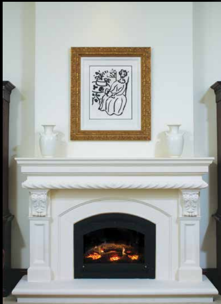
Mozart from "Create Your Own Mantel Collection", Fascia and Hearth.