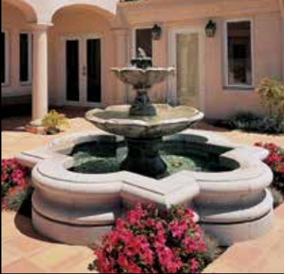
Arabesque Floor Fountain, and Columns.