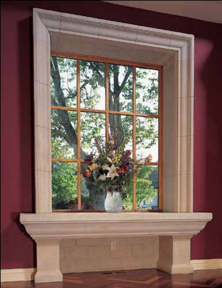
Interior Window Molding, Window Sill, Pilaster Legs and Wall Veneer.