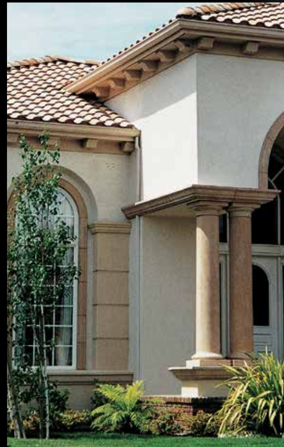
Window Molding, Segmented Wall Paver Veneer, Wainscoting, running Window Sill, and Tuscan Column.