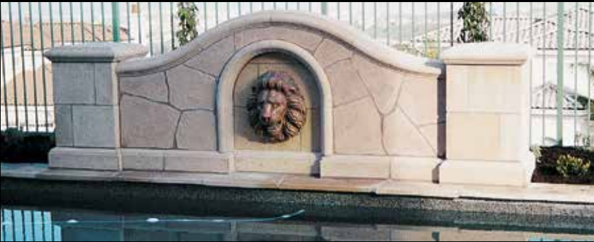
Wall & Pier Caps and Wall & Base Trims.