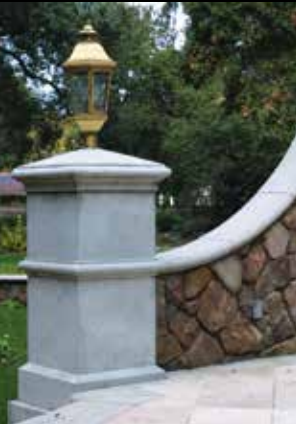
Ornamental Fence Piers.