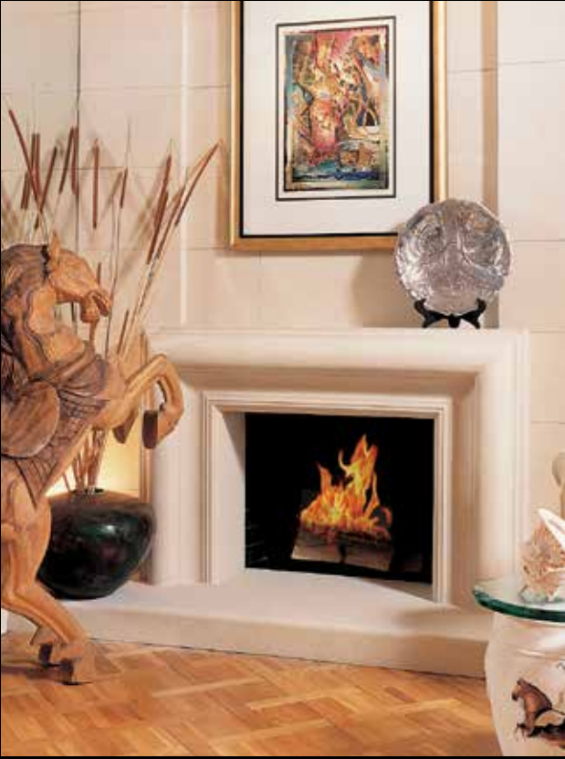
Tavares from "The Bolection Collection", Fascia and Hearth.