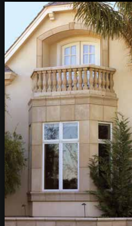
Wall Trim, Keystone, Wall Paver Veneer, Edge Coping and Balustrade System Style I.