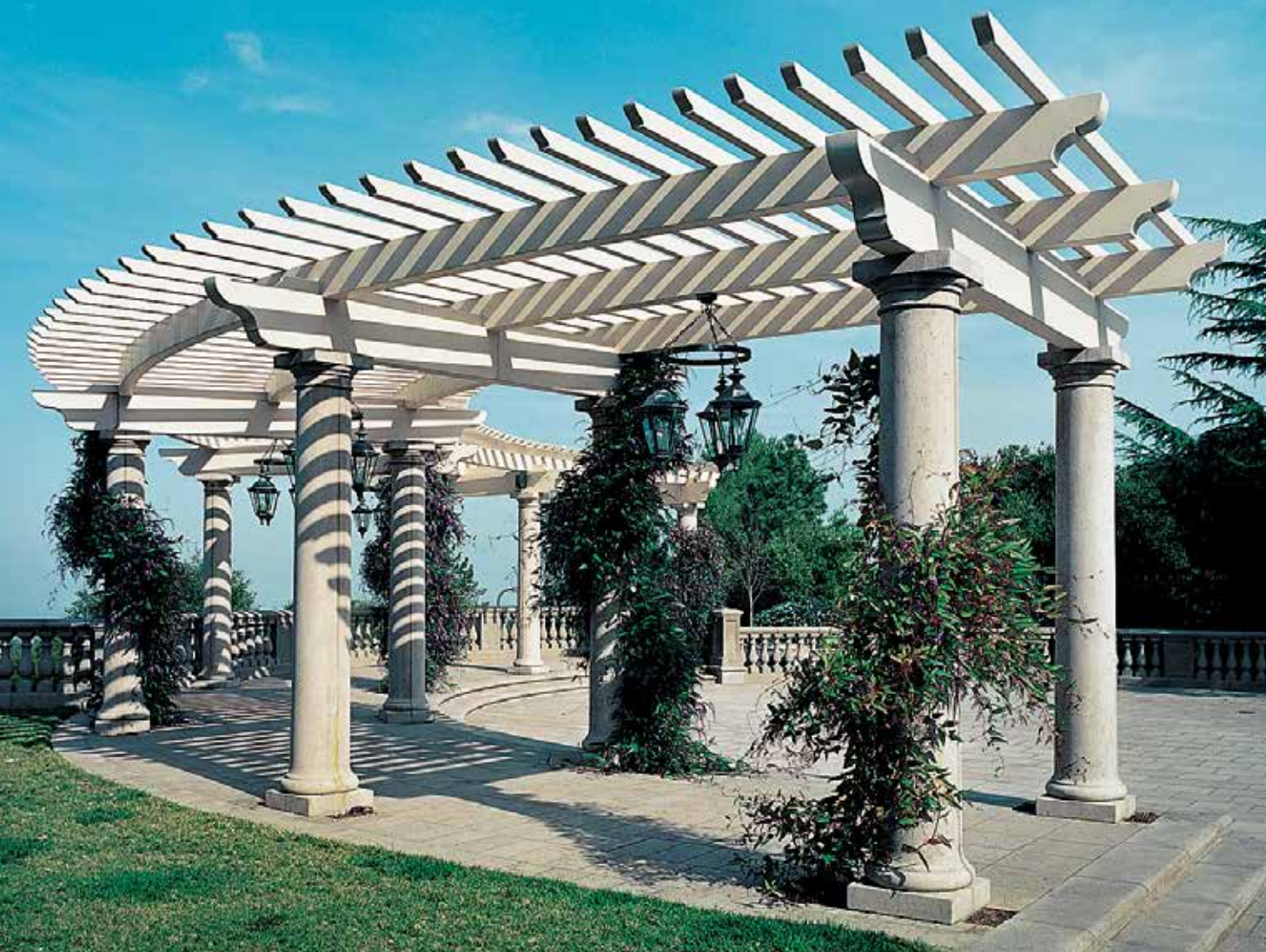
Tuscan Column Colonnade.

Architectural Facades offers six standard and custom designed columns: Tuscan Segmented, Tuscan, Ionic/Fluted, Corinthian/Fluted, Rope/Twisted, Pilaster/Square. All our columns are created with the finest lightweight materials.