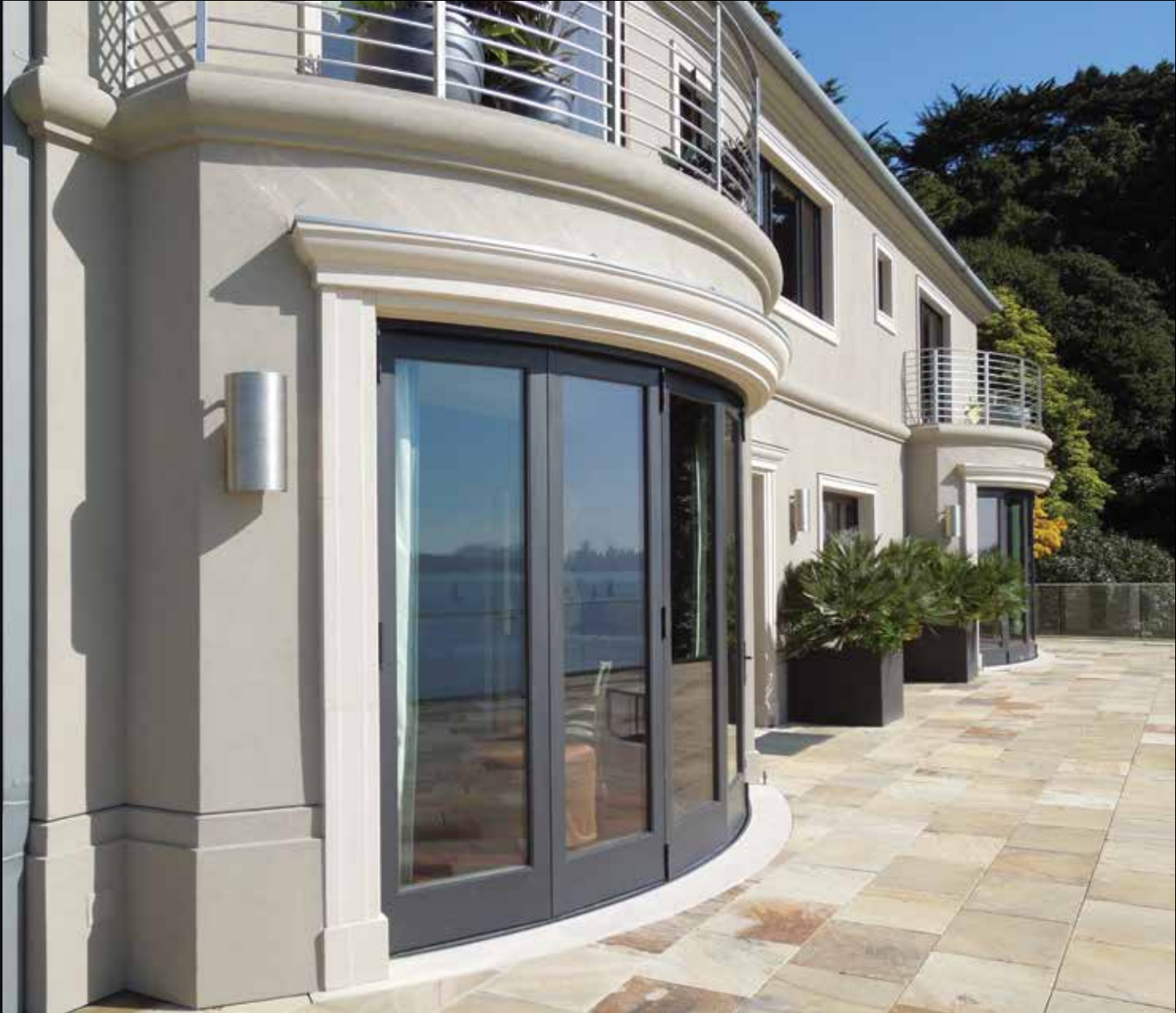
Radius Door Moldings, Window Sills, and Thresholds.