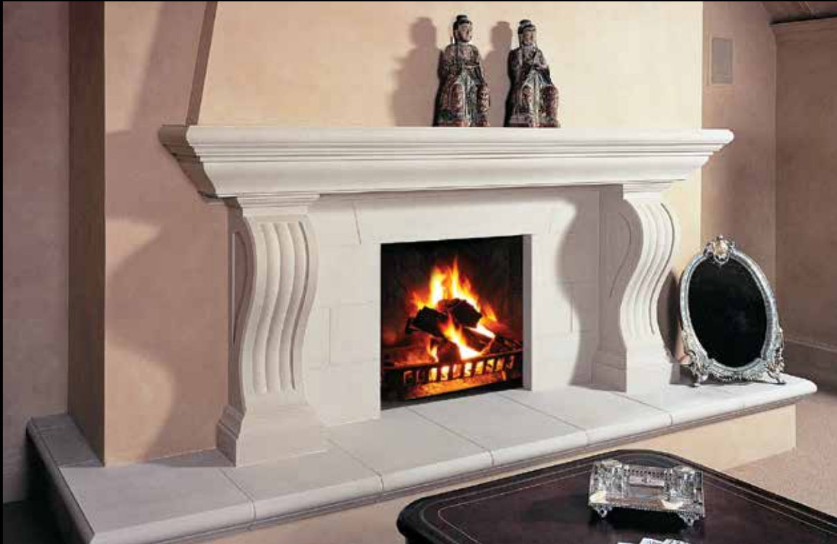
Vivaldi from "The Euro-Mediterranean Collection", Fascia and Hearth in Sandstone Finish.