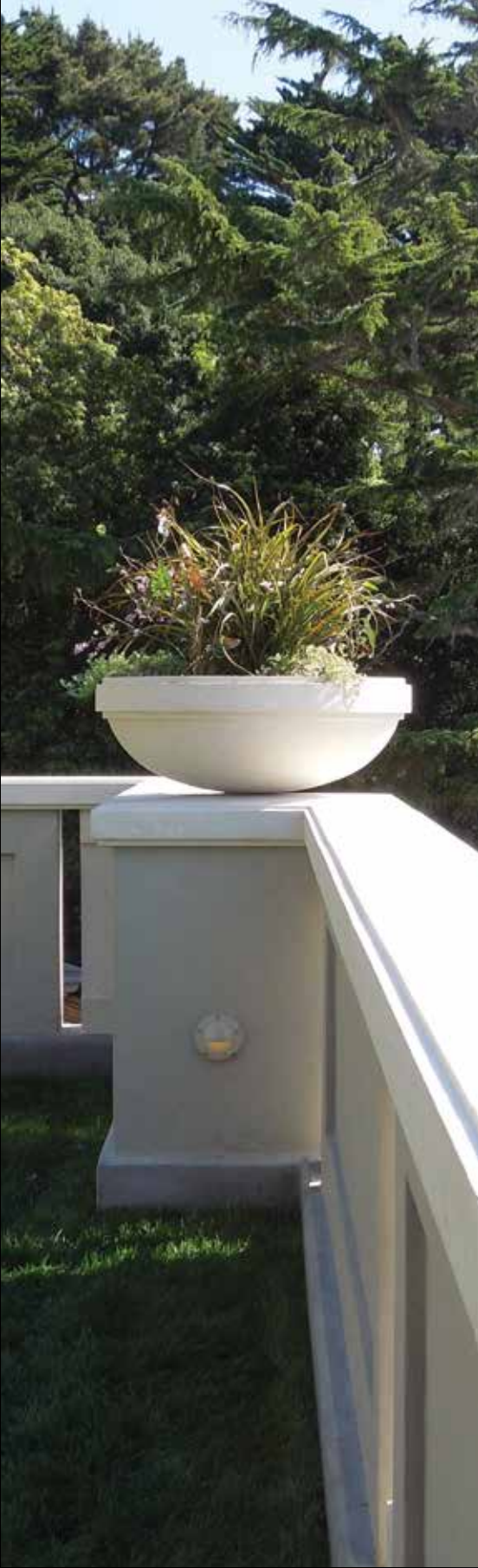
Planter and Wall Caps.