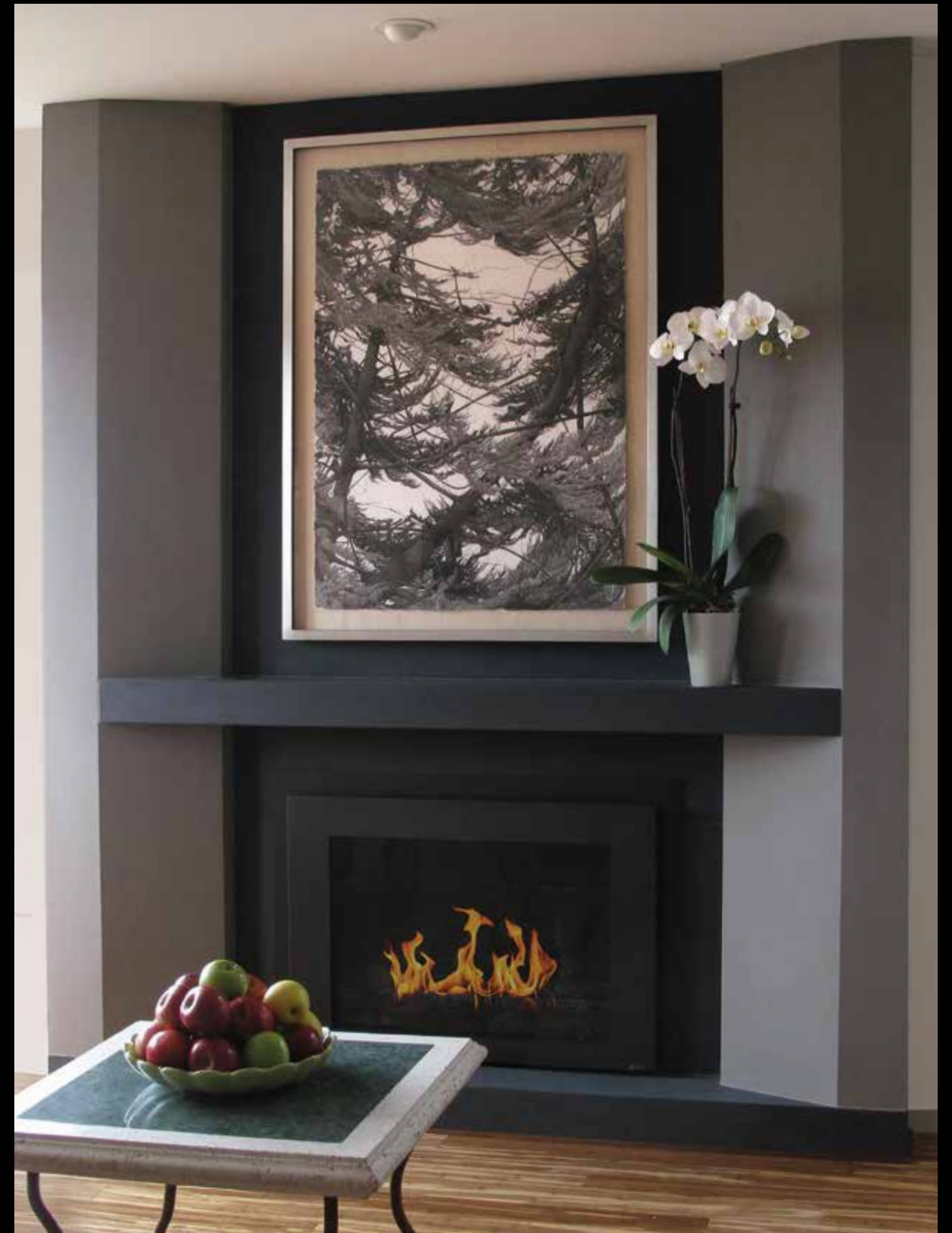
Stone Wall Surround in Grey Flannel and Black Granite in our Sandstone Finish.