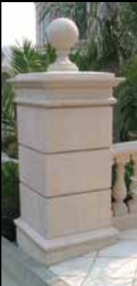
Segmented Entry Pier.