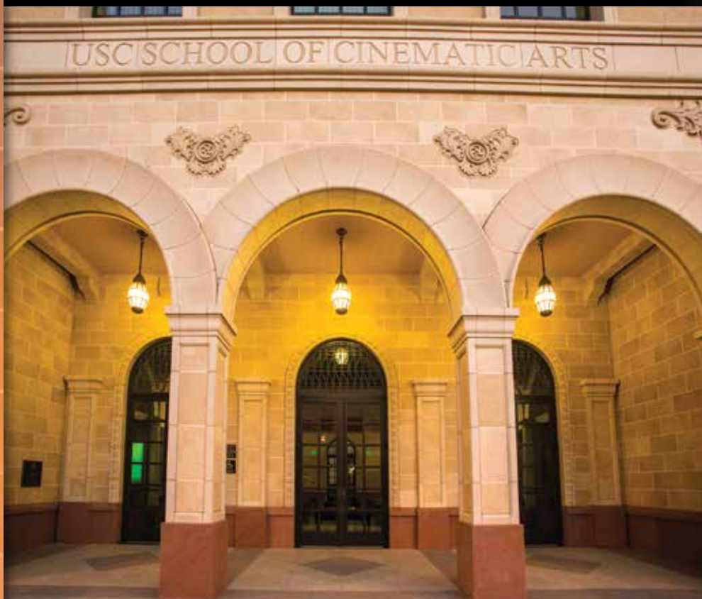
Signage, Lintels, Arch Entry & Door Moldings, Columns, Column Trims, Window Trims & Sills, Corner Quoins, Belly Bands, and Ornamental Wall Details.