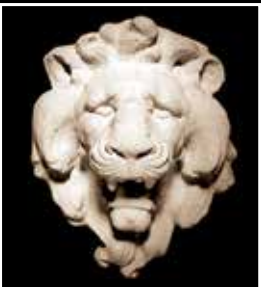
Plato Wall Mask