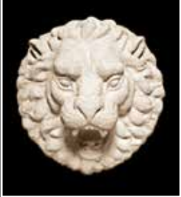
Aristotle Wall Mask