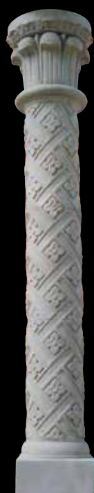
Custom Ancient Roman Column