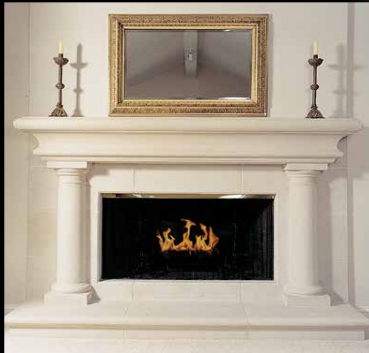
Tuscana from "Create Your Own Mantel Collection", Fascia and Hearth.