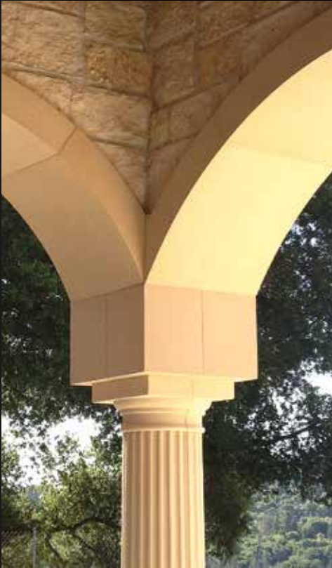
Portico Fluted Column and Arch Molding.