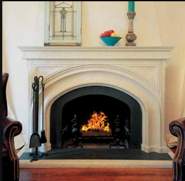
Aristocrat from "Xavier Collection", Fascia and Hearth in our Travertine Finish.