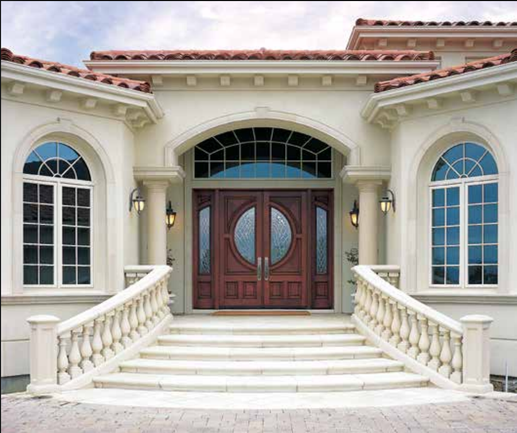
Balustrade Style II, Stair Tread, Tuscan Column, Lintel, Window and Wall Trim.