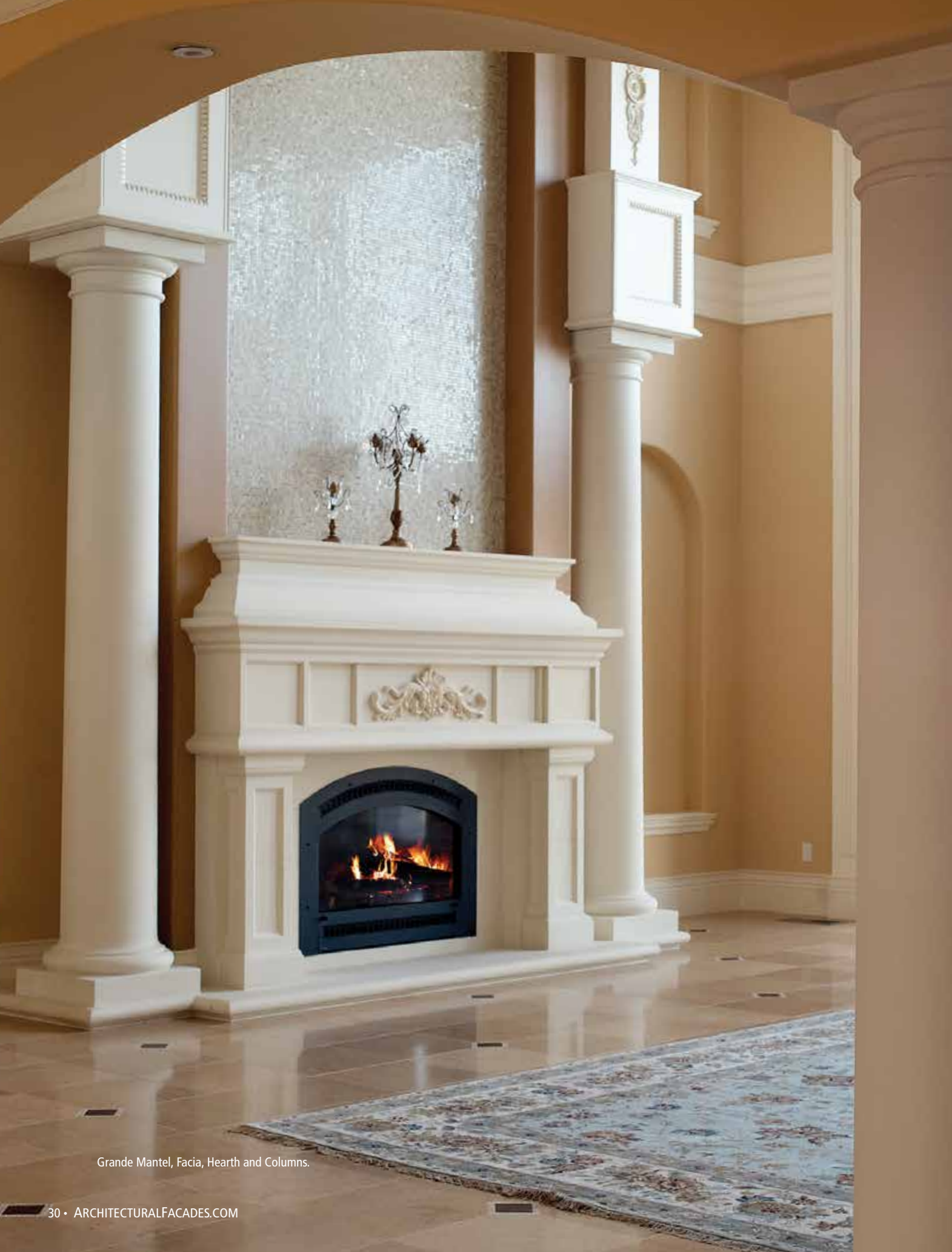
Grande Mantel, Facia, Hearth and Columns.

Architectural Facades Fireplace Mantels set the perfect ambiance for your living space.