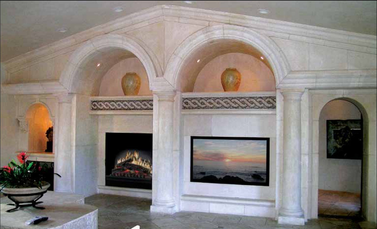
Mediterranean Custom Wall Mantel, Facia, Hearth, Moldings, Wall Veneer, Arches, and Columns in Travertine Finish.