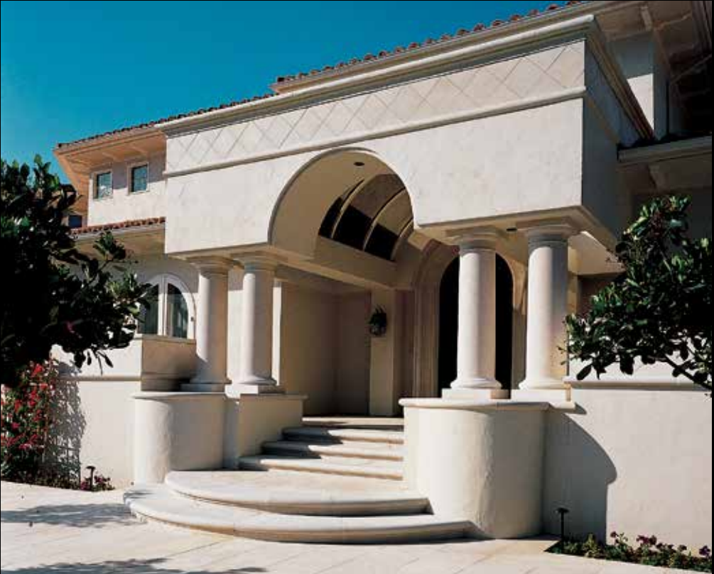
Lintel Veneer Trim, Columns, Wall Caps, Pavers, and Stair Treads.