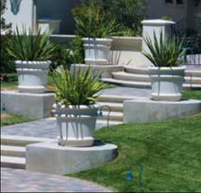
Round Banded Planters and Stair Treads.