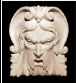
Zeus Wall Mask