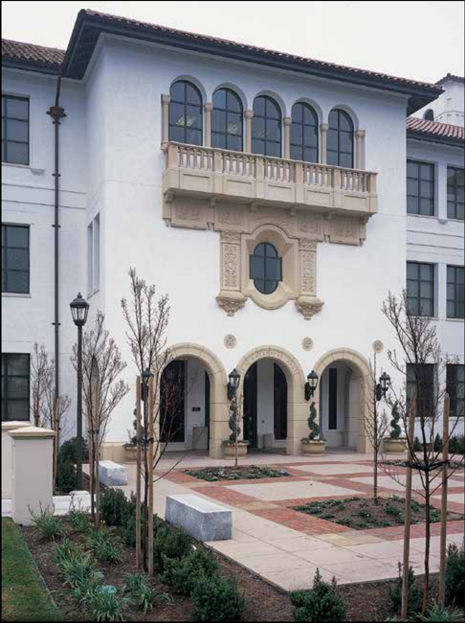
Courtyard, Entry Doors, Window Details - Ornamental Pediments, Balusters and Columns.