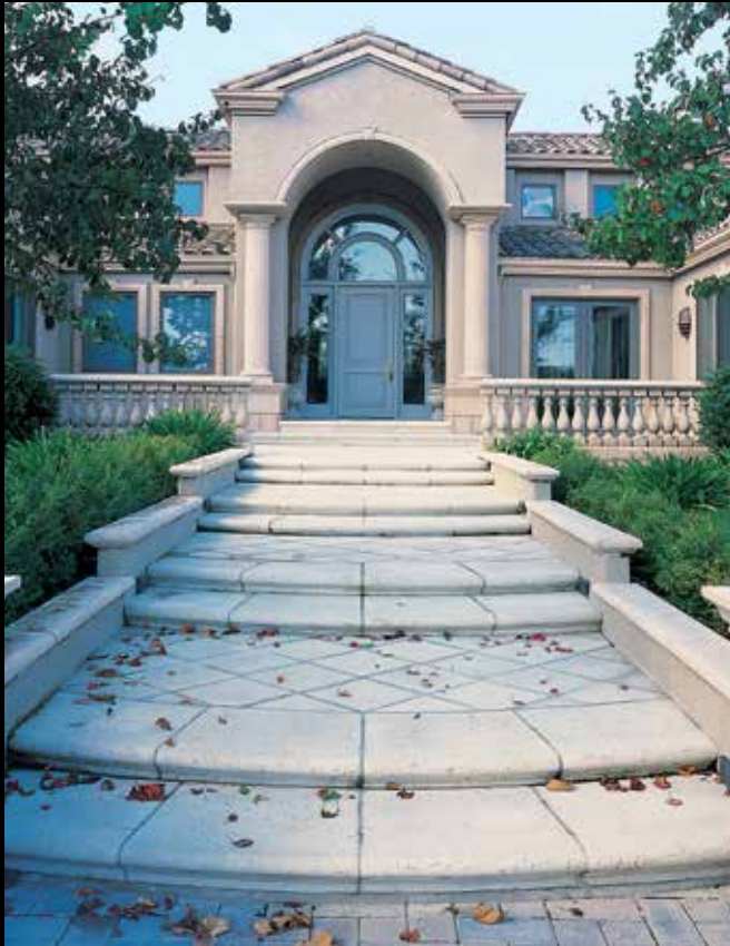
Stair Treads, Wall Caps, Balustrade System Style II, Window Trims and Columns.