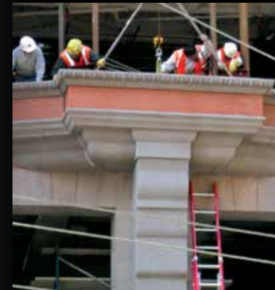
Image represents Architectural Facades GFRC precast restoration of twelve story Oriel Bay and other elements recreated from 19th century photographs.