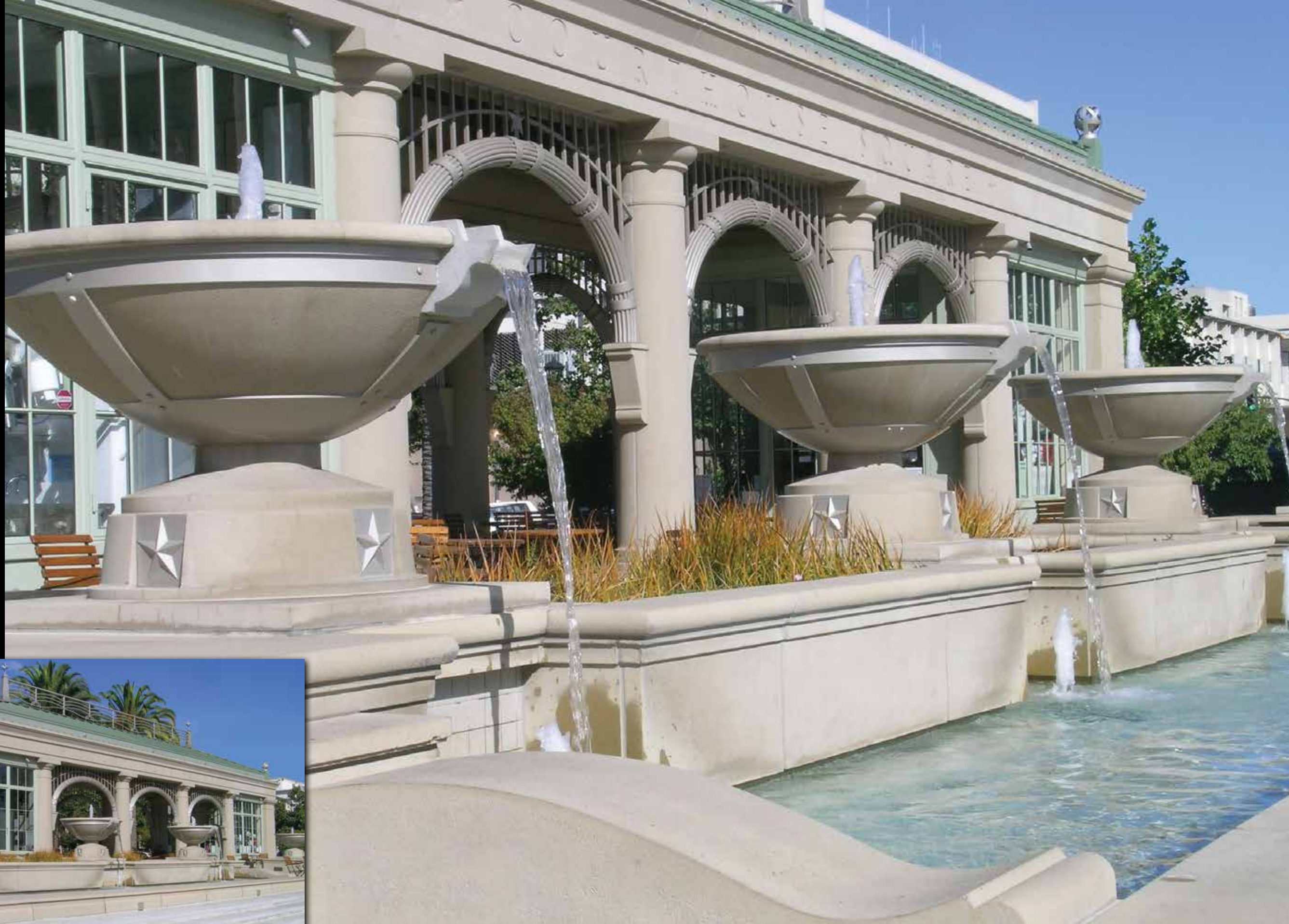
Redwood City Courthouse Plaza Fountain Bowls, Fountain, Columns, Pilasters, Signage, Lintels, and Cornices, in our Sandstone Finish.