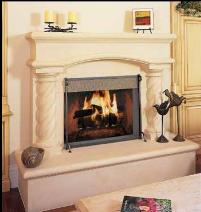
Monet from "The Create Your Own Mantel Collection", Fascia and Hearth.