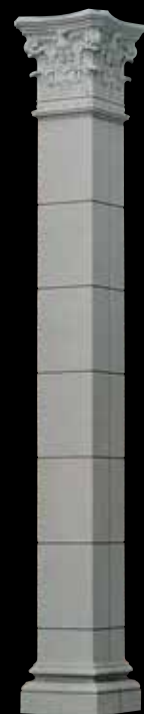
Segmented Square Column with Eagle Corinthian Capital

Architectural Facades offers six standard and custom designed columns: Tuscan Segmented, Tuscan, Ionic/Fluted, Corinthian/Fluted, Rope/Twisted, Pilaster/Square. All our columns are created with the finest lightweight materials.