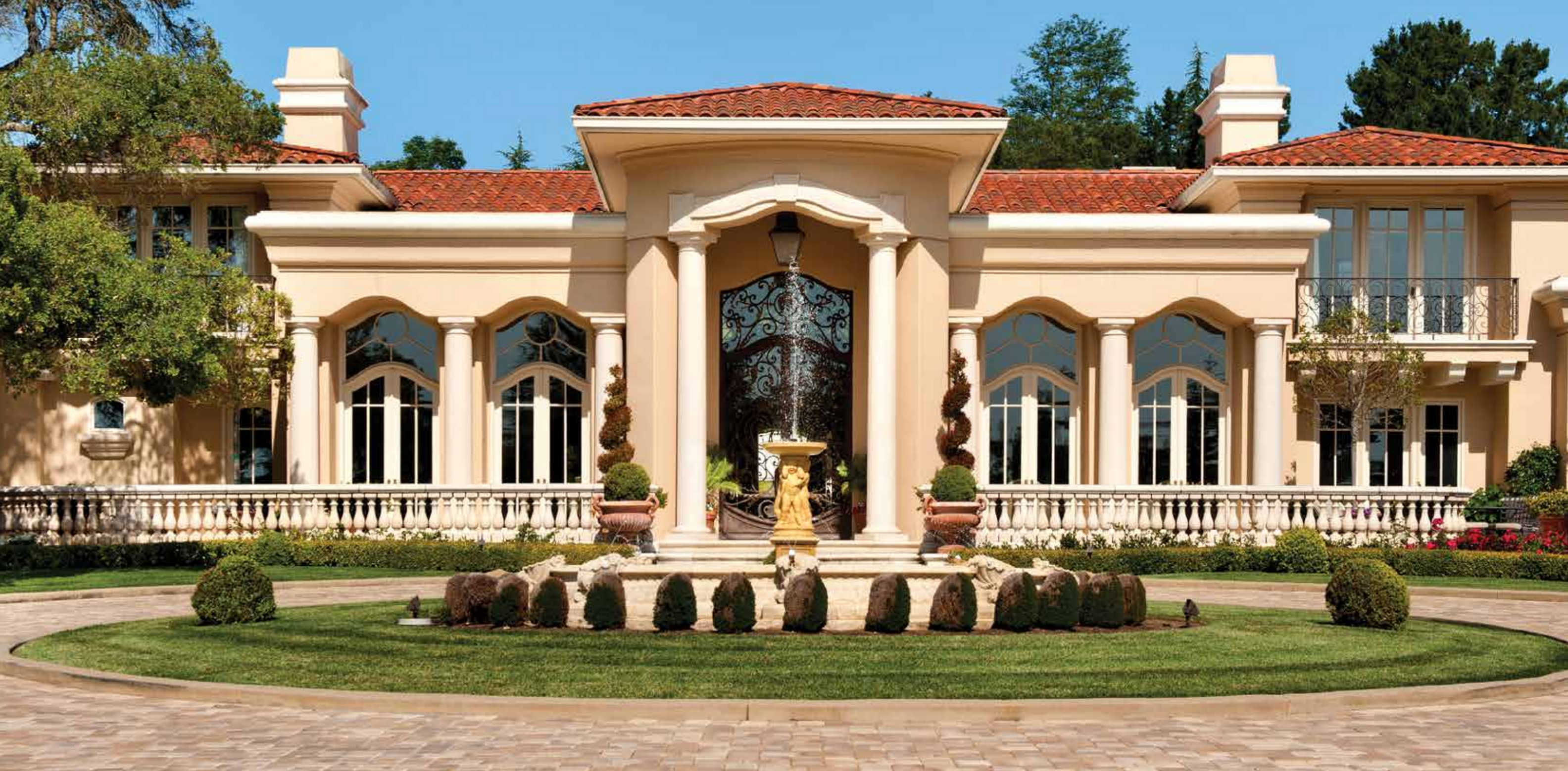
Image Represents Architectural Facades Columns, Lintels, Door and Wall Trims, Keystones, Stair Treads, Pier Caps, and Balustrade System.