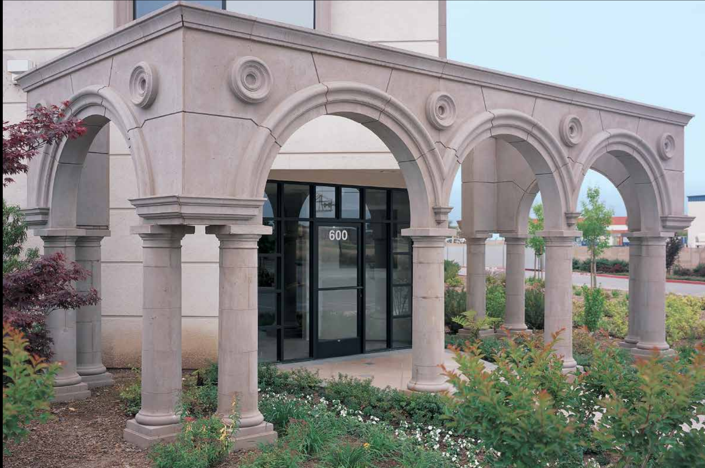
Entrance Facade to Architectural Facades Unlimited in Gilroy, California.

Cover Image: Balustrade, Columns, Lintels, Wall Trims, Keystones, Stair Treads, Entry Piers and Pier Caps.