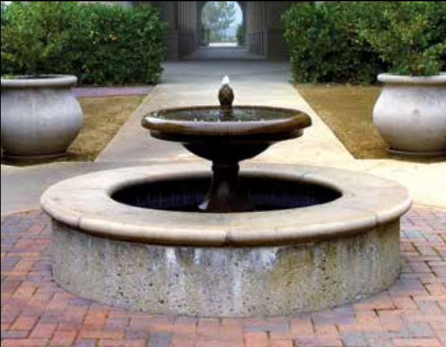
Courtyard Fountain, Chiseled Blockface Wall Veneer and Running Wall Trim.