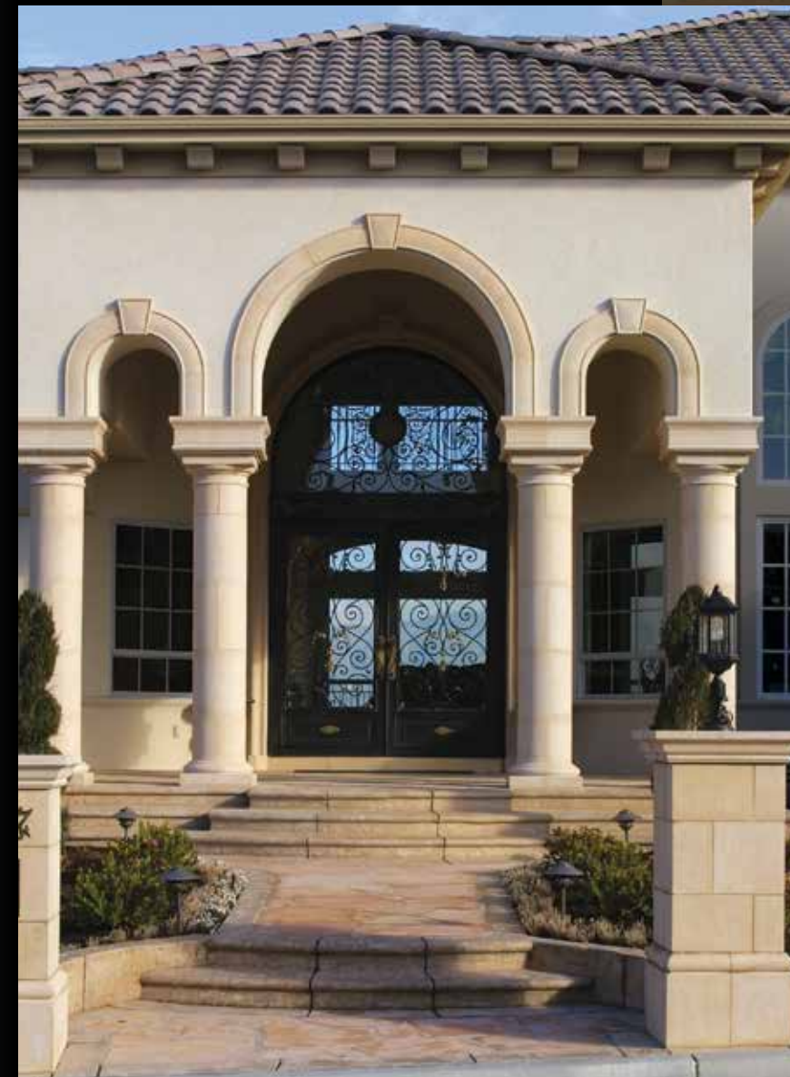
Tuscan Segmented Columns, Lintel, Wall Trim, Stair Tread, Paver Veneer Entry Piers.

Create an ambiance of classical old world beauty.