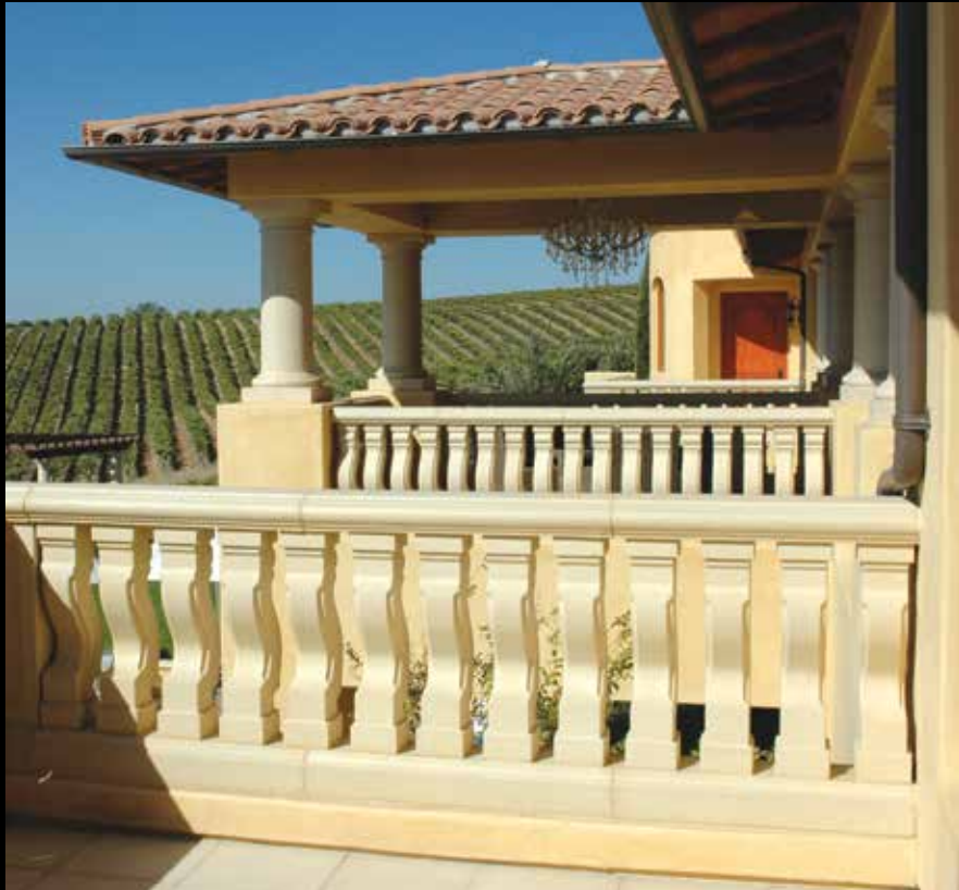
Balustrade Style IX, and Tuscan Columns.

The balustrade elements have been designed to be interchangeable, assuring your individual preferences.