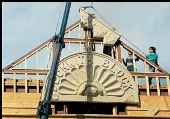
Installation of Architectural Facades GFRC sandstone facade.