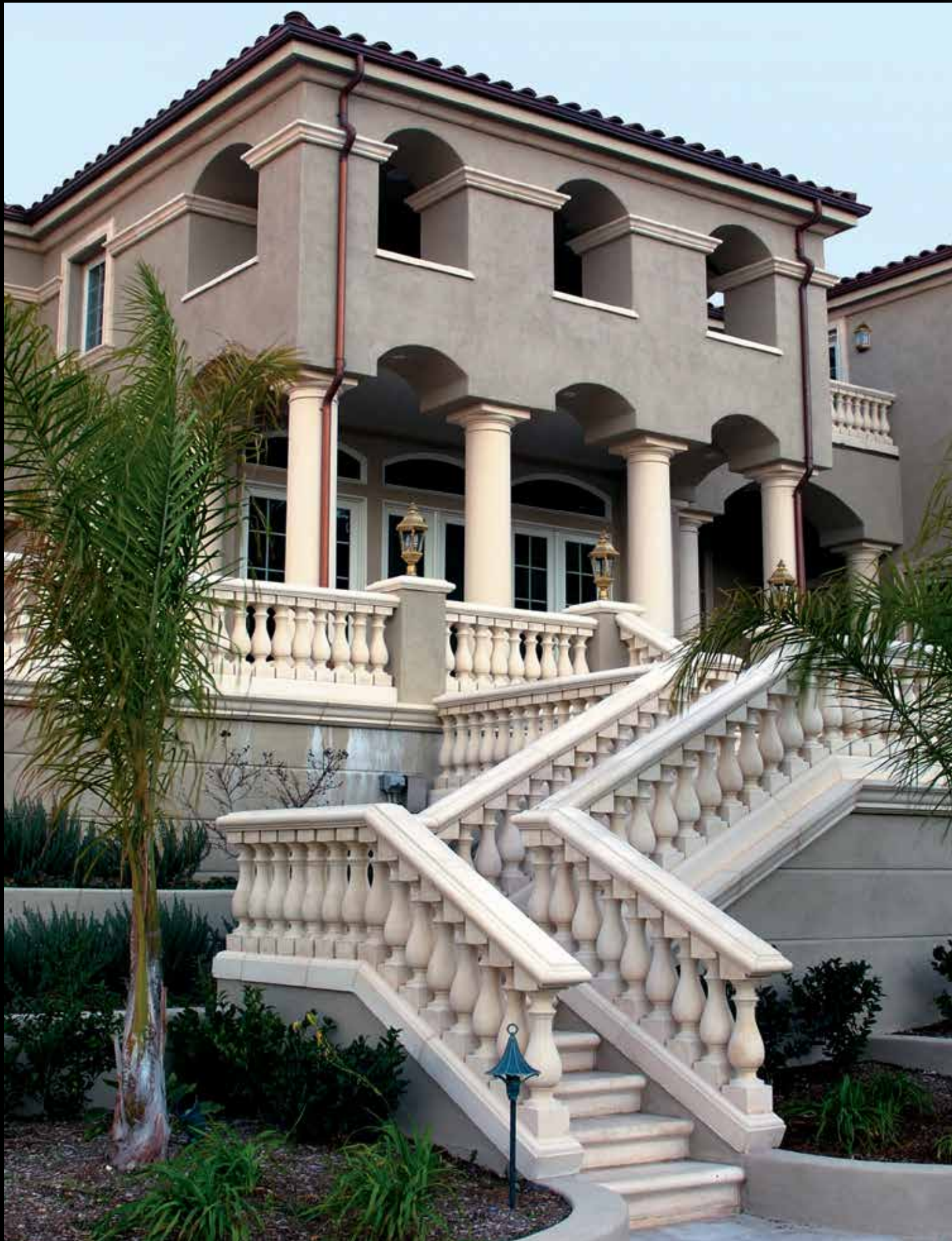
Balustrade System Style II, Pier and Wall Caps, Wall Trim, Tuscan Columns and Stair Tread.