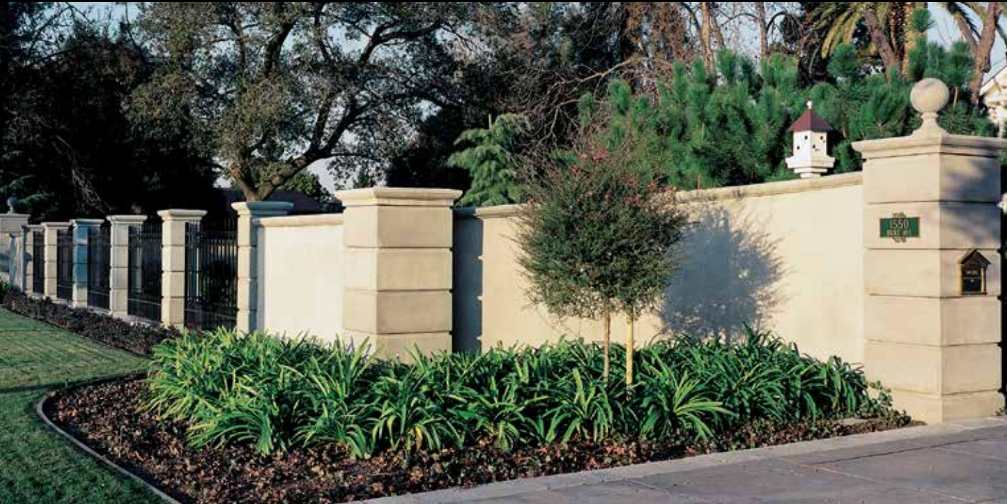
Segmented Entry & Fence Piers, Spheres and Wall Caps.