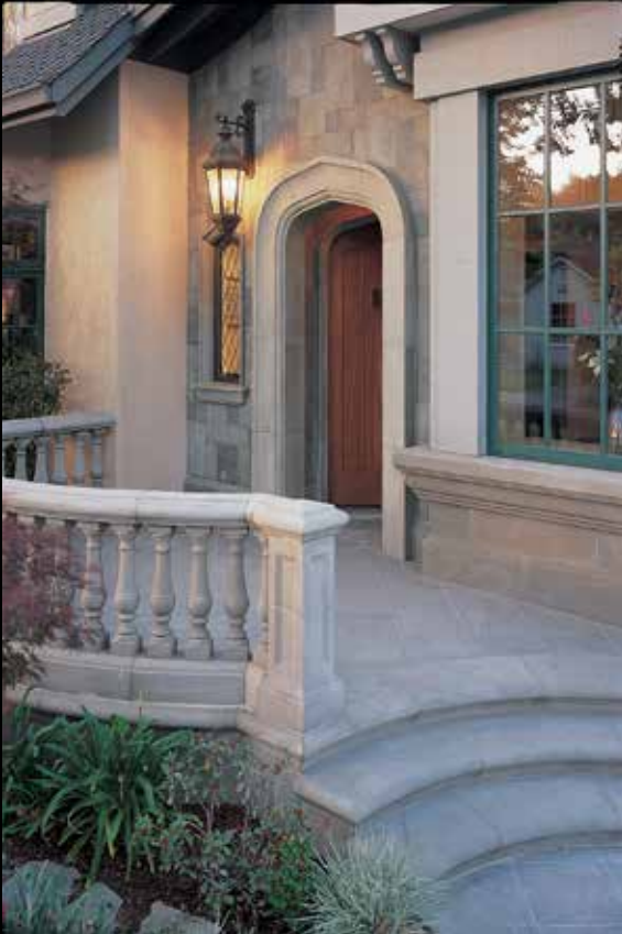
Balustrade System Style II with Custom Baluster. French Patterned Wall Veneer, Door Molding, Window Sill, Floor Paver and Stair Tread.