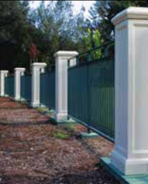
Entry Pier and Wall Caps.