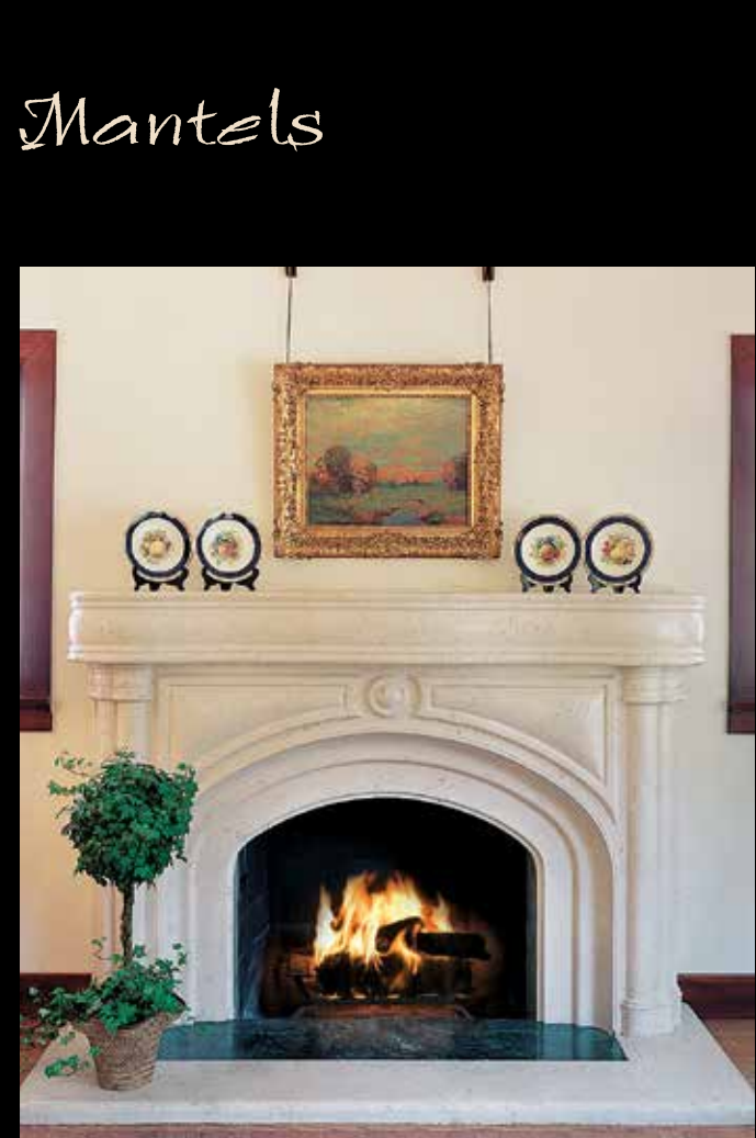
Esquire from "The Xavier Collection" and Hearth.