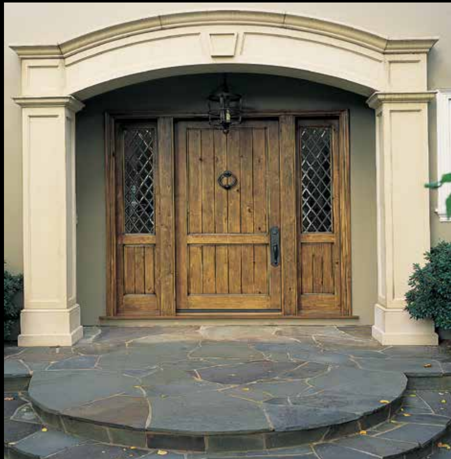
Arched Entry Panel Molding and Trim with Keystone supported by Square Panel Columns in our Sandstone Finish.