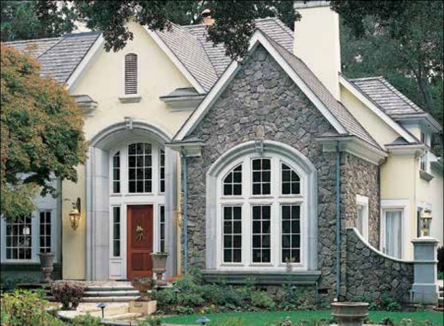
Window Sills, Moldings, Stair Treads, Wall Caps and Entry Pier.