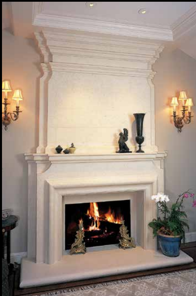
Normandy Mantel, Over Mantel, Fascia and Hearth in our Travertine Finish.