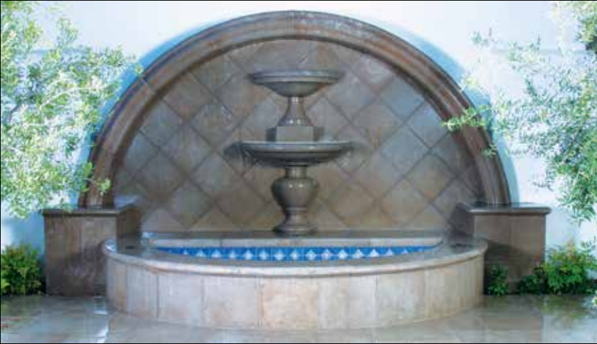
Radius Molding & Flat Wall Paver Veneer, Double Sided Pool Coping, Tiered Fountain Bowl.