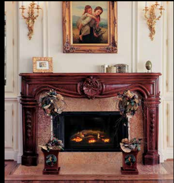
French Shell from "The Xavier Collection" in our Paint Grade Finish (Faux Finished).