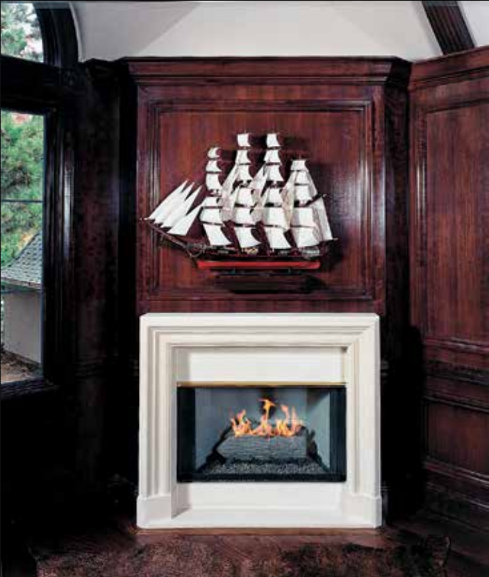
Sirah from "The Bolection Collection", Plinths, Fascia and Hearth.