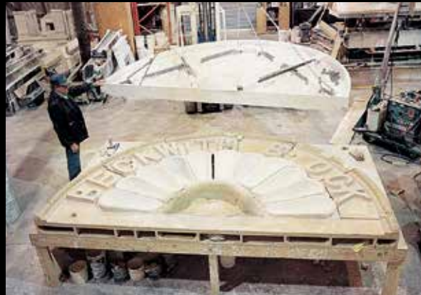
Pulling the mold from the pattern created by our in-house craftsmen.