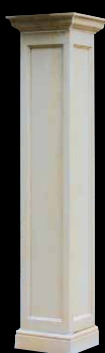
Square Panel Column