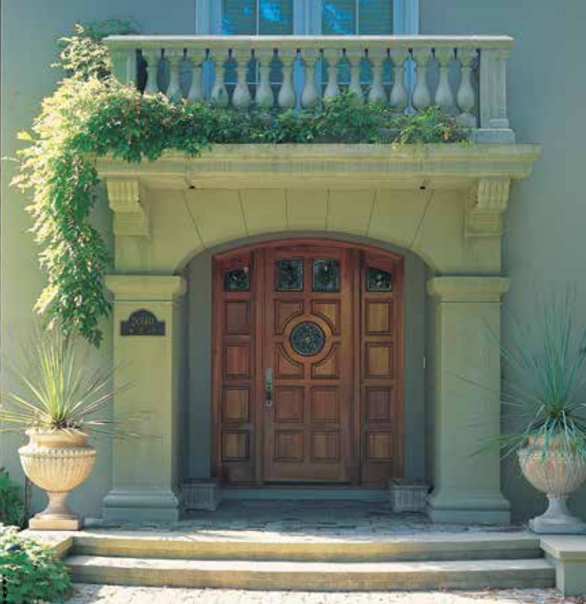
Archway, Pilaster, Corbels, Lintel, Balustrade Style II, Edge Coping, and Stair Treads in our Sage Mist.