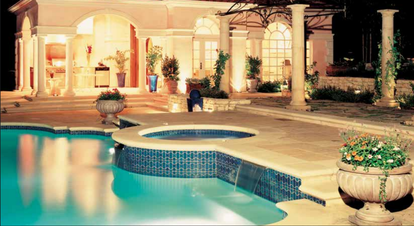
Columns, Moldings, Lintels, Wall Caps, Pool & Edge Coping, Corner Quoins, Pavers, Stair Treads and Planters.