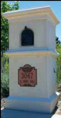
Mail Box Pier.