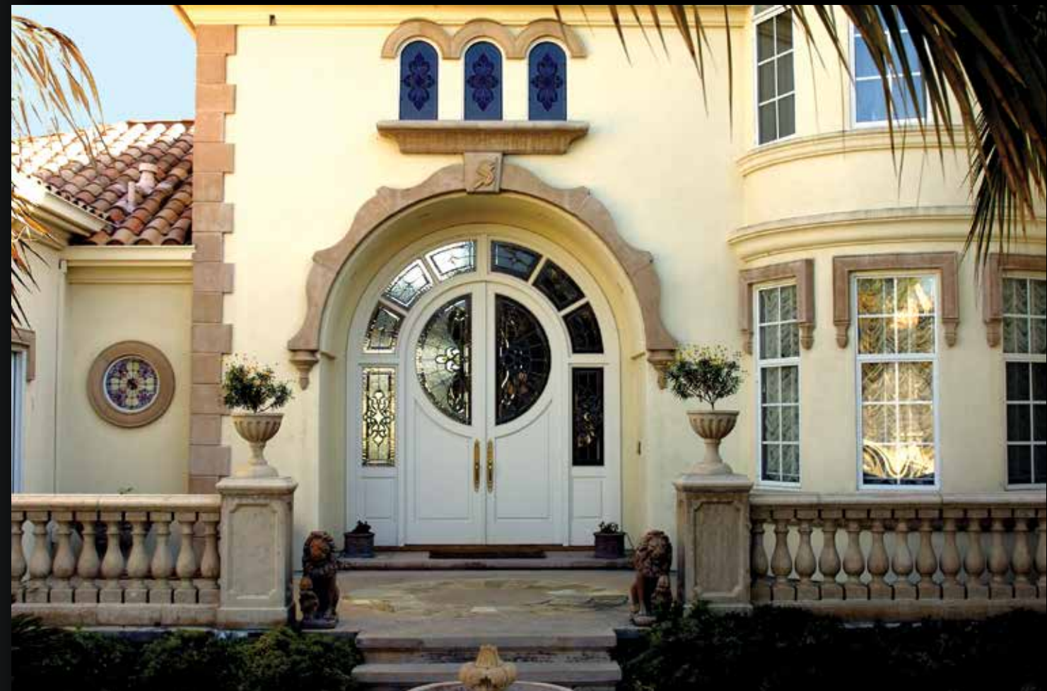
Custom Entry Arch with Keystone and Finial, Window Sill, Window Trim with Finials, Corner Quoins, Planters and Balustrade System Style II.