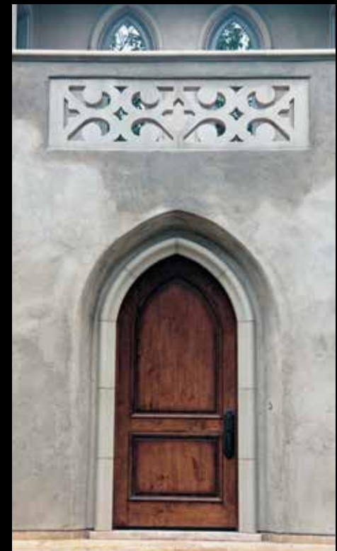
Decorative Open Wall Panel, Segmented Gothic Arch Entry Door and Window Trim.