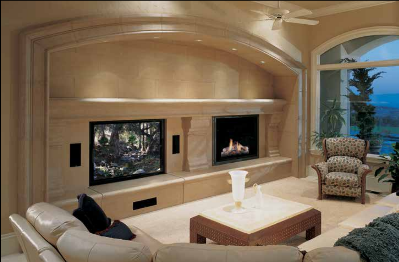
Tuscan Echo Mantel from "Create Your Own Mantel Collection", Fascia, Hearth, Wall Panel and Wall Molding in Travertine Finish.