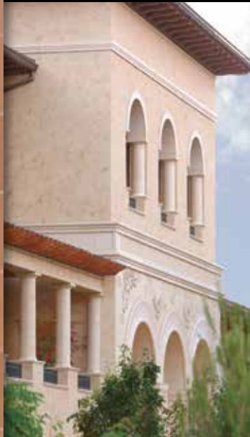
Corner Quoins, Lintels, Entry Moldings, Window Trims & Sills, Belly Band Trims, and Columns

APA Winner for Excellence and Craftsmanship