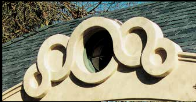
Custom Decorative Pediment Arch Molding, and Segmented Pilasters in our Sandstone Finish.