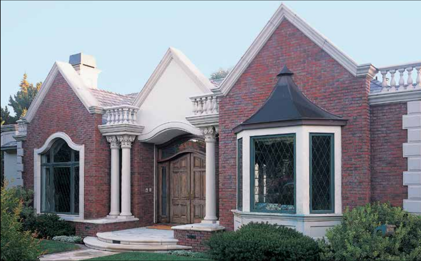
Window Molding, Tuscan Columns with Corinthian Capital, Balustrade Style II and Roofline Molding, Stair Tread, Wainscoting Wall Veneer and Corner Quoins.