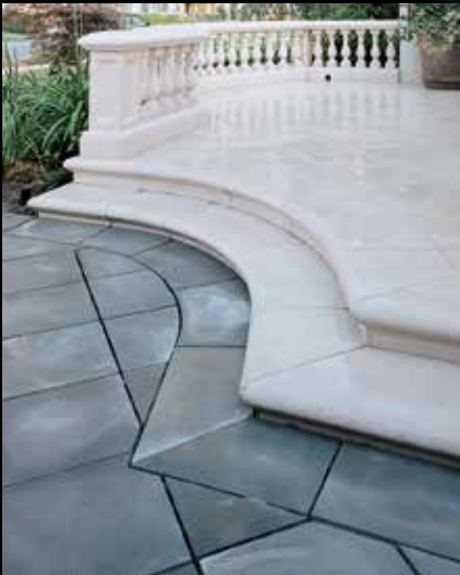
Stair Treads, Pavers and Balustrade System Style II.