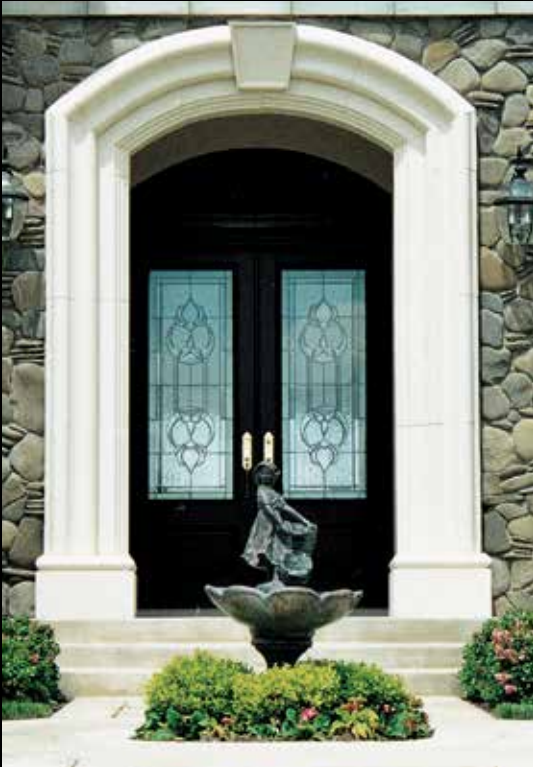
Entry Door Molding, Keystone and Plinths.