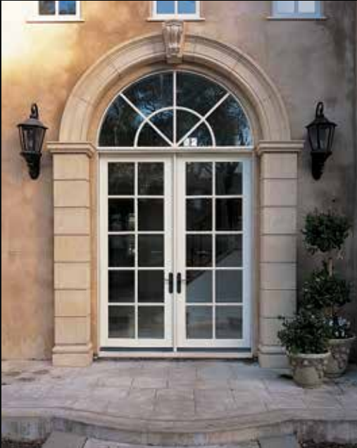
Arched Molding, Keystone, and Pilaster Columns.